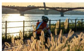
Hangang Bike Path