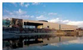
National Museum of Korea