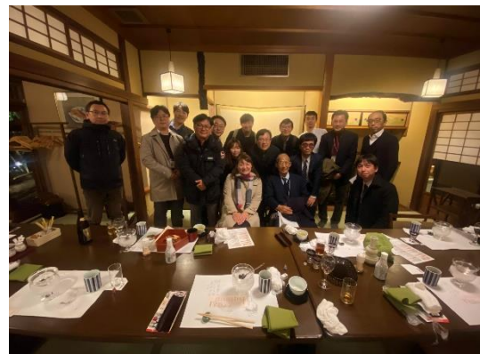
ISTD 2019, Osaka, Japan