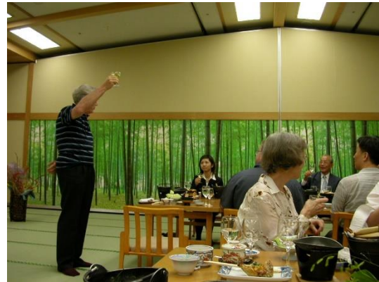
ISTD 2005, Kirishima, Japan