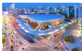
Dongdaemun Design Plaza