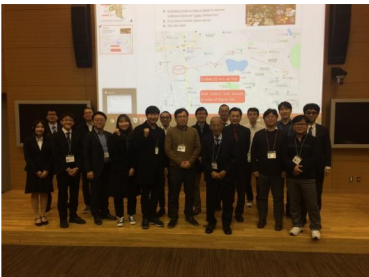
ISTD 2019, Osaka, Japan