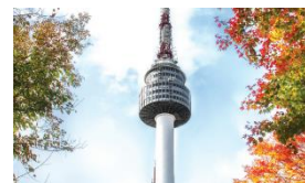
Namsan Seoul N Tower