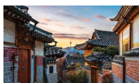
Bukchon Hanok Village

South Korea boasts abundant tourist attractions. Tourists can experience distinctive harmony between historical cultural heritage and modern culture. With these preserved local identities, tourists can also explore and enjoy local cultures, natural environments, and unique food. More information on https://www.korea.net/AboutKorea/Tourism .