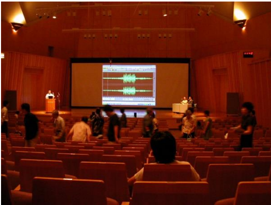
ISTD 2005, Kirishima, Japan