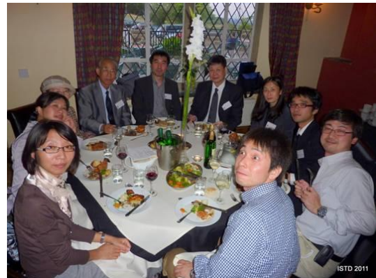
ISTD 2011, Sheffield, UK