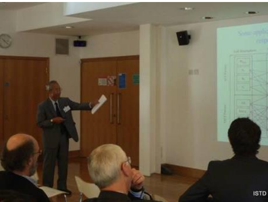
ISTD 2011, Sheffield, UK